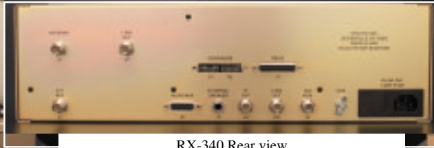
RX-340 Rear view